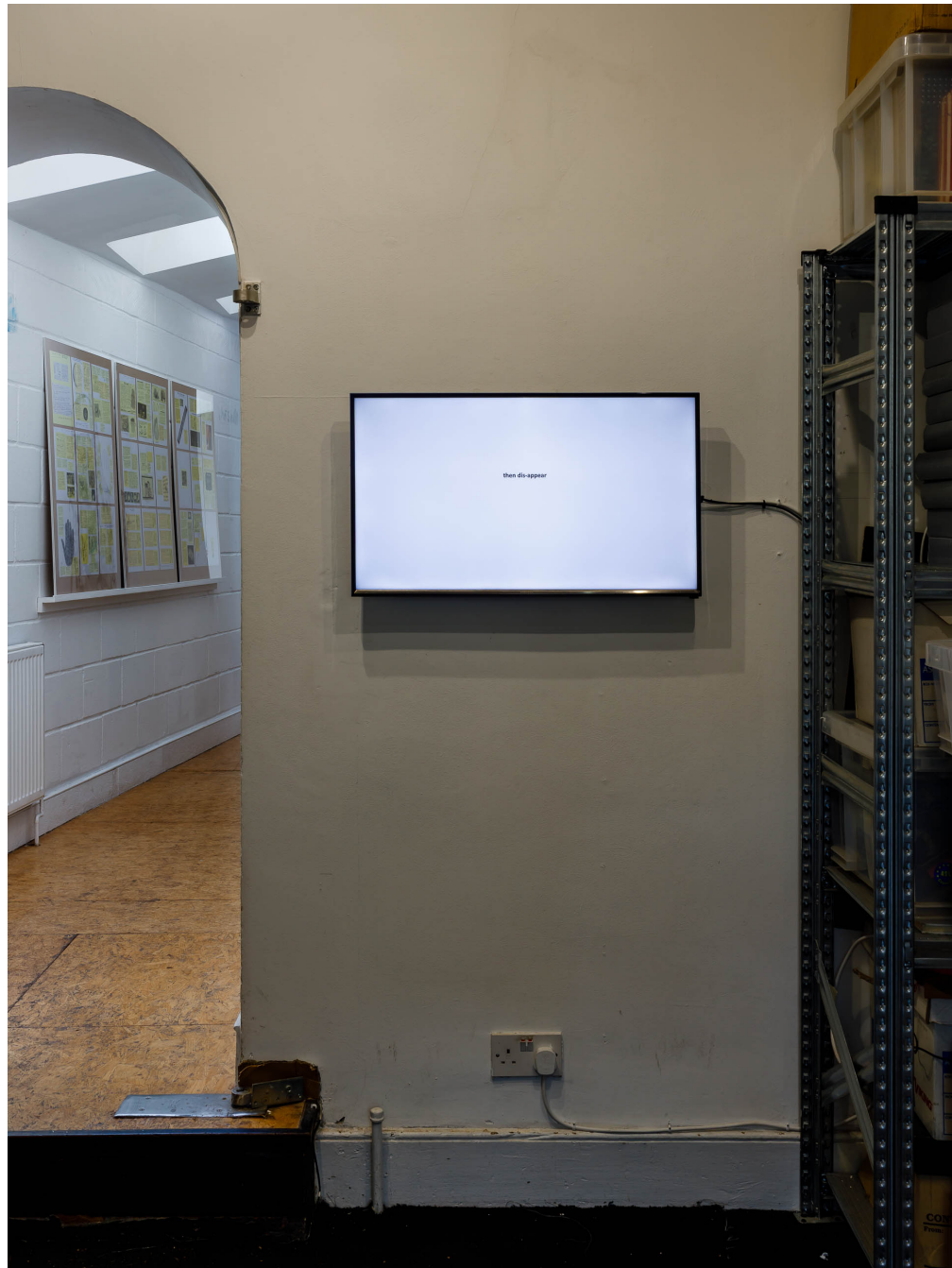
Hester Reeve A Case for Ontological Equipment Video, 3 mins, 2018-ongoing, this version 2023