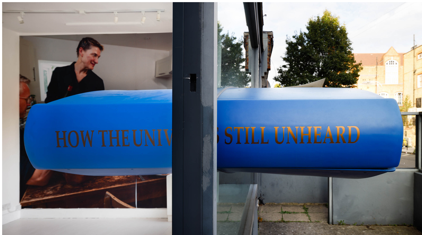
John Latham How the Univoice is Still Unheard 2003

Permanent sculpture considered integral to First Hand exhibition