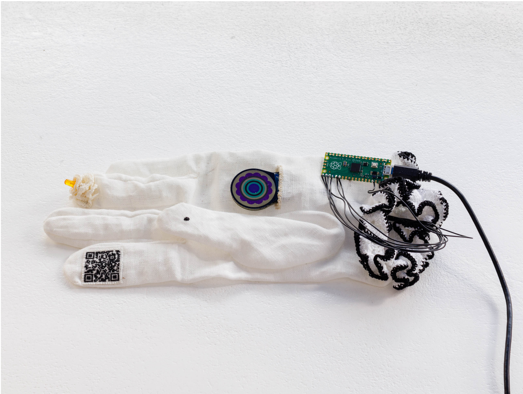
Jan Hopkins Function Glove (sineflower) USB powered device, handcrafted linen glove, LCD screen with machine generated animation, embroidered QR code, 2023